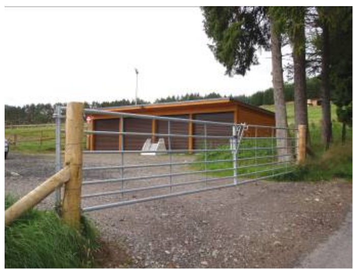
Fig. 2 : Garage and entrance in the northern area of the site

4. The horse ménage has been developed on land immediately adjacent to the garage. This exercise area measures approximately 33 metres x 18 metres. The ménage is bounded by timber post and rail fencing. A raised path in the form of a grassed earthen mound has also been created adjacent to the eastern boundary of the ménage. The first of the two horse shelters for which permission is being sought is located in the yard to the east of the ménage. Construction materials are similar to those used on the garage and the structure has a floor area of 31.5 square metres (3.5m x 9m). The front elevation has three door openings, providing access into three separate areas - the tack room and two stables. The second horse shelter is in a more exposed and elevated location on higher ground in the horse grazing field in the south western area of the site. Materials are similar to the previously detailed structures, although the roofing material in this instance is black felt. The structure is comprised of just one open stable, and has a floor area of approximately 22.75 square metres (6.5m x 3.5m). There are two openings, one of which is in the form of a stable door, while the second wider opening is a steel gate. The applicant has clarified that neither of the horse shelters have a foundation and they are essentially moveable structures.