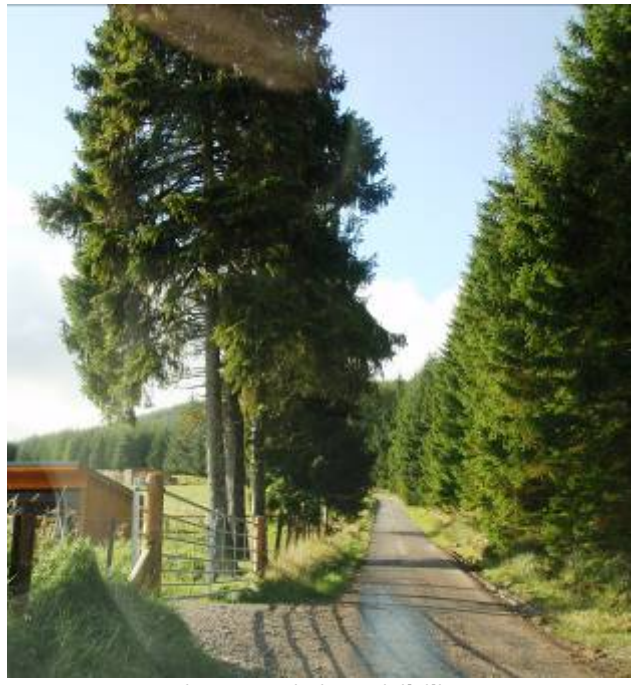
Fig. 5 : existing visibility

view that the acceptance of a slightly reduced visibility splay is the most appropriate option.