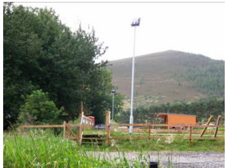
Fig. 3 : View towards the ménage and horse shelter