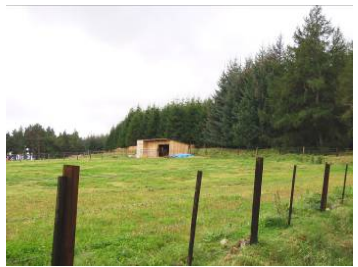
Fig. 4 : Horse shelter no. 2

5. The feed store which is located on the south eastern boundary of the site close to the ménage has the same external finishes as the stables and garage, although the timber cladding is stained green, instead of the brown stain that is evident on the other structures. The feed store has a floor area of approximately 15 square metres (6m x 2.5m) and is accessed by a single entrance door. As detailed earlier another aspect of the development proposal originally was for the erection of 4 floodlights, where a flood light has been positioned at each corner of the ménage. Each of the floodlights extended to 5 metres in height and the drawings provided indicated that the lights were 500 watt. The floodlighting has however been recently omitted from the proposal. The final aspect of the proposed development, as detailed in the application description, is the change of use of the land from agricultural to horse grazing.